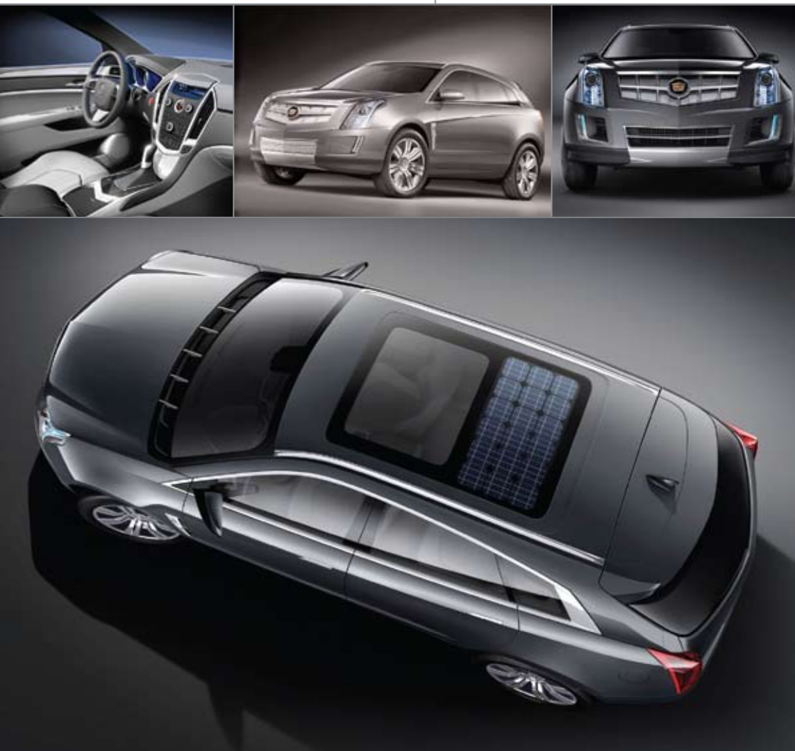
Life. LIBERTY. AND THE PURSUIT.