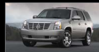
2008 Cadillac Escalade